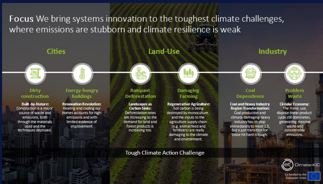
Figure 1: EIT Climate-KIC’s focus on bringing systems innovation to some of the most intractable climate action challenges

Our attention is focused on systems where emissions are tough to reduce – cities, land-use, industry – and on some of the most intractable challenges associated with these systems (see fig 1).